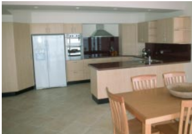
Kitchen from dining area

The gourmet kitchen has all you would wish for & much more. It is appointed with state of the art appliances including dishwasher, microwave, touch pad hot plates and double oven. The two door fridge has a door mounted water/ice dispenser. The kitchen opens out to the dining area and the view. The granite bench tops and glass splash backs enhance the appeal.