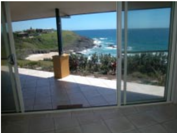
View over Wakki Beach from the living room

The large living room has stunning views on three sides which can be enjoyed whilst relaxing in the very comfortable leather lounge suite.