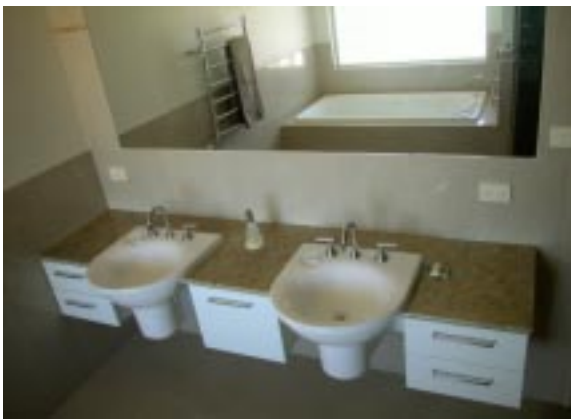
Part of bathroom 1

Both spacious bathrooms have a spa bath, double shower, double vanity and separate toilet. They each have a heated towel rail. Bathroom 1 has a built in laundry, with front loading washing machine, drier and laundry sink.