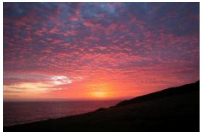
Sunrise from living area of villa

The villa has a separate audio visual room with a plasma screen TV and surround sound. It will play DVDs, DVDRs, CDs, CDRs and MP3 discs. Pay TV is available with additional movies and world movies provided. This can all be enjoyed whilst relaxing in another very comfortable lounge suite.