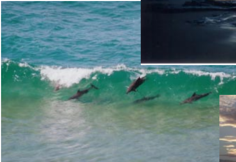
Scenes from Wakki Beach

The villa has the ultimate design and features to provide a totally peaceful and relaxing holiday, in an idyllic beachside setting.