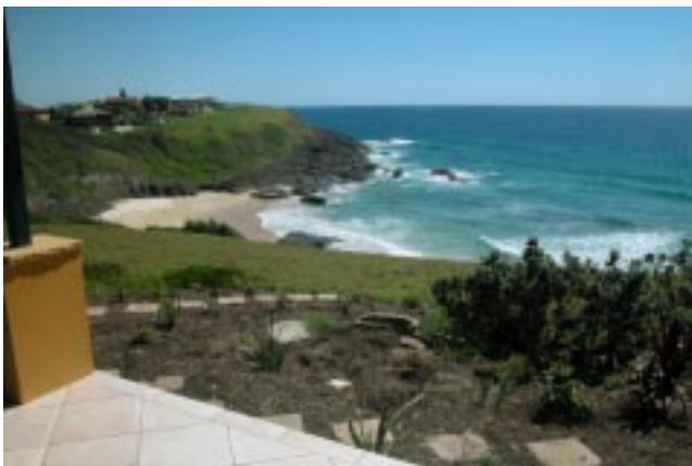
A little of the spectacular view from the front verandah

The dining and living areas open onto a large spacious tiled verandah, which returns around the north east corner of the villa. It is fully covered to maximise its use in all weather. Spectacular 270 degree beach, headland, ocean and mountain views are to be enjoyed from the timber outdoor furniture settings on the verandahs.