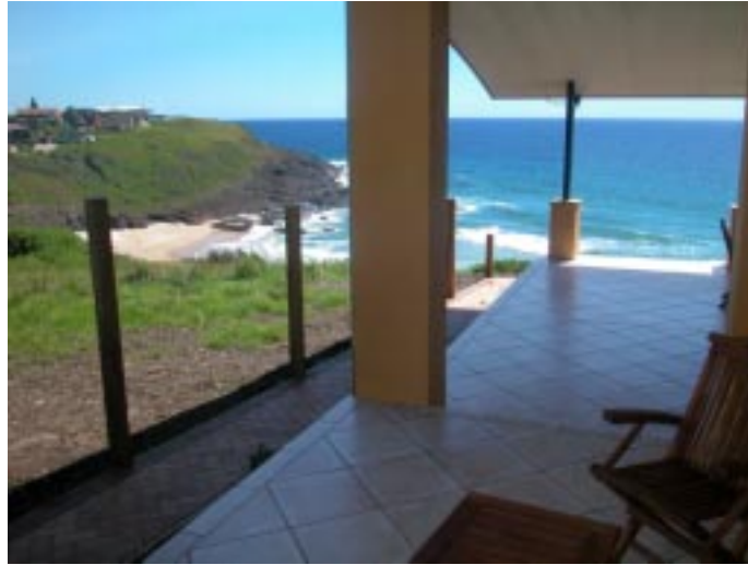
View from bedroom 1, over its own verandah

The bedrooms are located either side of a wide hallway that opens out to the view. Each bedroom has ocean and beach views which can also be enjoyed from their own verandahs.