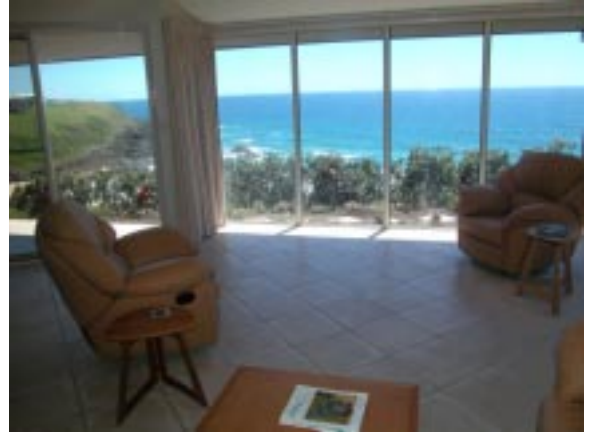
Part of the view from the living area

The dining and living areas open onto a large spacious tiled verandah, which returns around the north east corner of the villa. It is fully covered to maximise its use in all weather. Spectacular 270 degree beach, headland, ocean and mountain views are to be enjoyed from the timber outdoor furniture settings on the verandahs.