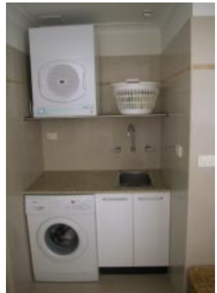
Laundry in bathroom 1