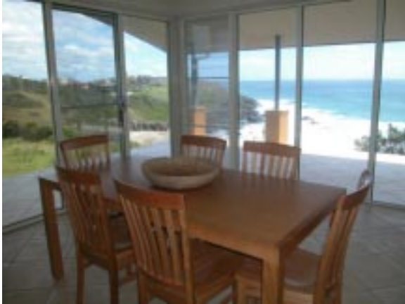
Some of the view from the dining area

The kitchen, dining and living areas all face stunning uninterrupted views to the east through a continuous wall of glass which wraps around on both the northern and southern sides. All these rooms look out over Wakki Beach and the ocean.